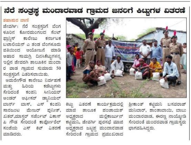
Newspaper coverage of the event.