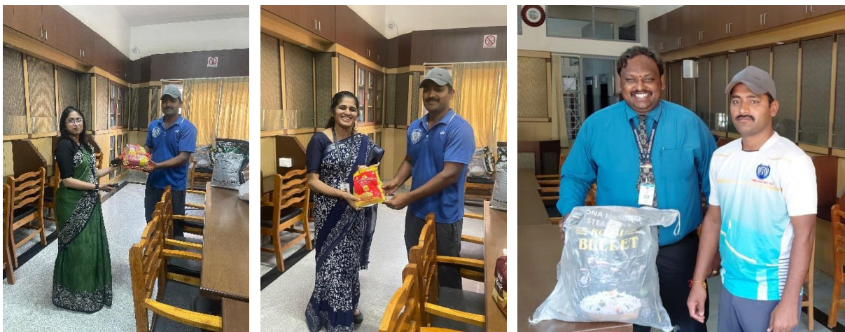
Contributions from college faculty and students toward the distribution of free food kits.