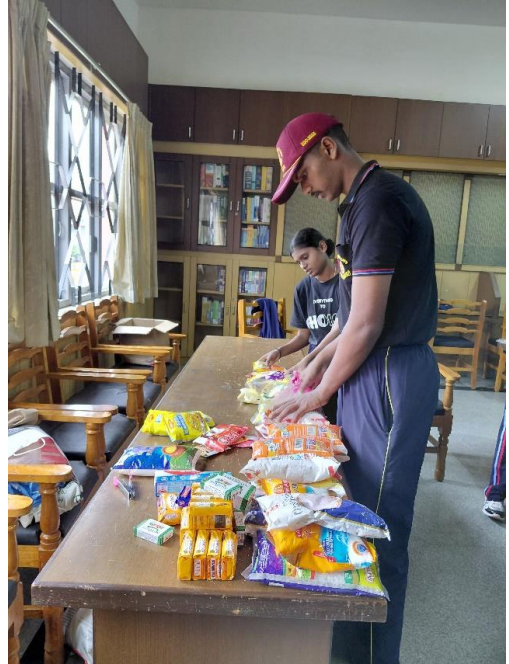
Cadets engaged in packing food kits.