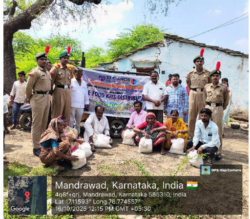
Cadets distributing free food kits to the flood-affected families of Manderwad village, Kalburgi District.